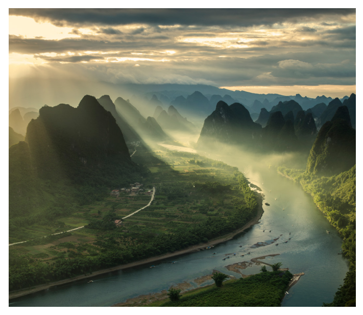
The Environment Building a "Beautiful China"

data management practices, inviting security concerns. The competition will significantly increase and even well-established MNCs should prepare for their competitors to eat away at market share. While China is well on its way to leading the world in some technology fields, it will still need significant foreign support in others before it can catch up with its foreign counterparts. Foreign businesses may therefore still be able to capitalize on China's thirst for innovation.